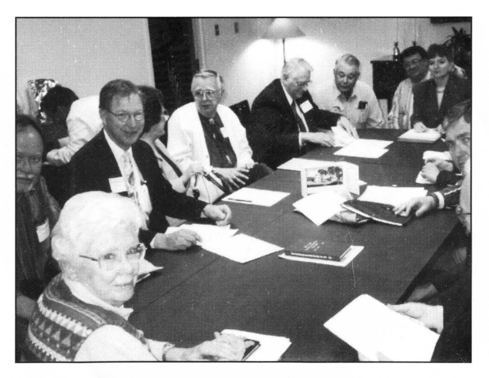
1996 Spring Meeting of the Board of Directors

DEADLINE FOR ALL BOOK AND GRANT AWARDS IN JANUARY 1, 1997. FOR APPLICATION INFORMATION AND FORMS CONTACT THE ASSOCIATION OFFICE.