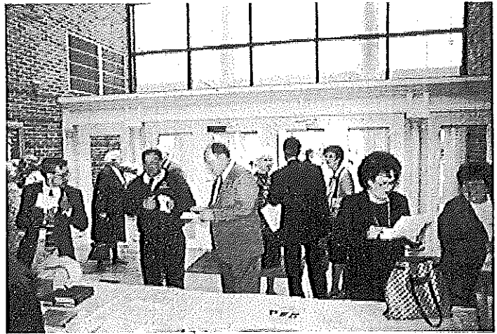
Registration at the 1998 WTHA meeting held in Abilene.

All sessions will be held at the Holiday Inn Hotel and Suites 4300 W. Hwy 80, Midland, TX 79706. For room reservations at the Holiday Inn call 915-697-3181. The conference rate is $55.00. Mention the WTHA to get their discount. This rate will be effective until March 17.