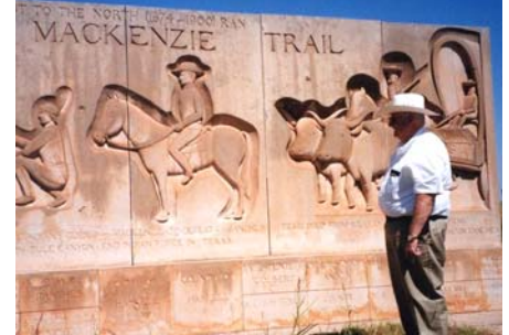
Clint Chambers at the Mackenzie Trail marker north of Stamford, Texas.

The association board was busy and met the next week (September 28) in Stamford for its Fall meeting. While important business took place, your board members were most impressed with the traditionalstyle Texas eats served up at the Cliff House.