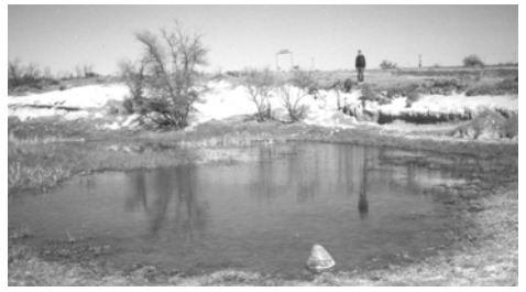
Monument Springs still produces water today. testified to the approaching settlement of the barren plains.

One of the Llano Estacado's most interesting historic landmarks was a man-made structure that stood for only a short time, yet left a indelible record of its existence. Designed to serve as a beacon to guide thirsty travelers to a nearby spring, the landmark was called a "prairie lighthouse" by its builder. Although it was less than eight feet high, the lighthouse stood on top of a mesa that rose above the surrounding plain. Its near-white color allowed it to be seen from several miles in any direction. It was a monument that