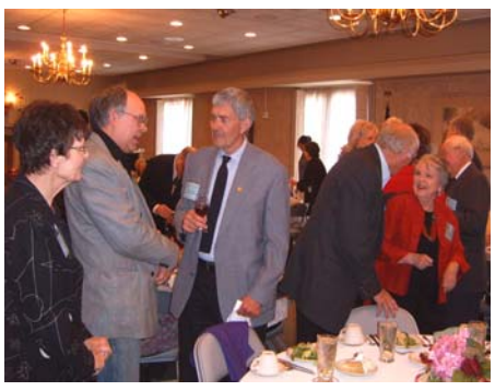
WTHA members at the 2009 conference banquet. a.m. Friday and continue through 12:15 Saturday. The program will also include book exhibitors and a silent auction.

The Thursday activities and all programs of the "East meets West" conference take place at the Marriott Hotel at Champions Circle off State Highway 114. Sessions will begin at 8:00