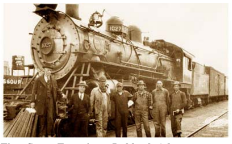
First Santa Fe train to Lubbock (photo courtesy of the Southwest Collection).

A decade later, Singer had close neighbors in the towns of Lubbock and Monterrey, on opposite sides of the Yellowhouse. Civic rivalry was intense, but cool heads prevailed. The towns combined under the Lubbock name on a new location south of the canyon. It was