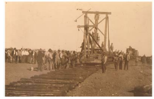
Track being laid for the Santa Fe line into Lubbock.

In the Fall, there was bad news from the railroad. The shops for the main line would be built fifteen miles southeast of Lubbock. The railroad wanted divisions of