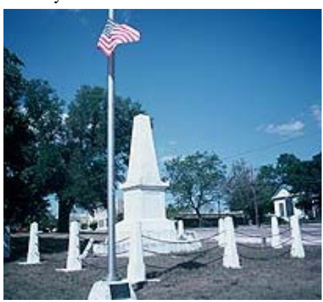
The Treue der Union Monument in Comfort, the only monument to the Union erected by a southern state.

The stringent measures enforced against Association Peace ended immediate threat of organized Unionist resistance in the settled areas, but it by no means spelled the end of factional hostilities or of anti-Southern activity on the part of the discontented. The method of the resistance protest was indicated by the action of the Texas legislature in January 1862, in passing a measure providing imprisonment for from two to five years for persons convicted of "discouraging the people from enlisting in the service of the State or the Confederacy or disposing the people to favor the enemy., 10 Further evidence lawlessness, dissention, and defection were on the increase came in July when General McCulloch issued establishing martial law in the Texas Military District.