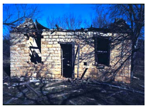
Ruin of a house at the site of Camp Cooper.

It is notable that further, pushing them so closely that they road. On the 27<sup>th</sup>, we made about fourteen miles; rained several times during the day with a heavy mist at night. August 28, had made about fourteen miles when we were met by the express with my wagon and the hospital steward; and, after preparing a pallet of blankets for Murphy and Clark, made about fourteen mile further, and encamped near the overland road. Night very damp and foggy. August 29, made about thirty miles on the overland road; clear, bright day and night. August 30, reached Camp Cooper about 6 p.m., having marched nearly the whole day through the rain, arriving just in time to be able to cross Clear Fork [before it became unfordable from the rise]."