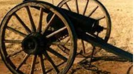
Fort Phantom Hill today.

Manuscript records in the federal archives at Washington reveal the details of the history of The Post on the Clear Fork of the Brazos. Shortly after we acquired the Mexican Cession in 1848, travelers began to make their way across western Texas toward the California gold fields. When they passed the border settlements the hostile Indians destroyed their caravans, murdered the emigrants, and took away as booty all their equipment. Then, too, many times the bleaching bones of the argonauts were left on the uncharted prairies and deserts as mute evidence of the dangers of Western travel. In order partially to guard against these dangers, the federal government sent Captain R. B. Marcy in 1849 with a detachment of eighty men to survey a route from Fort Smith, Arkansas, to New Mexico and California. On his way out via the Canadian River, he established a route which was later known as the Albuquerque Trail, and on his return journey he passed along the frontier of Texas and surveyed what the War Department named the Marcy Trail. A short time later, in planning a line of forts for the protection of the Texas border settlements, the return route was adopted.