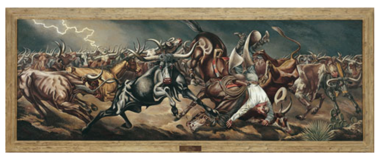
Gaze upon Tom Lea's WPA mural-- Stampede

We was camping on the Pecos when the wind began to blow, And we doubled up the guard to hold them tight, When the storm came roaring from the north with thunder And with rain,