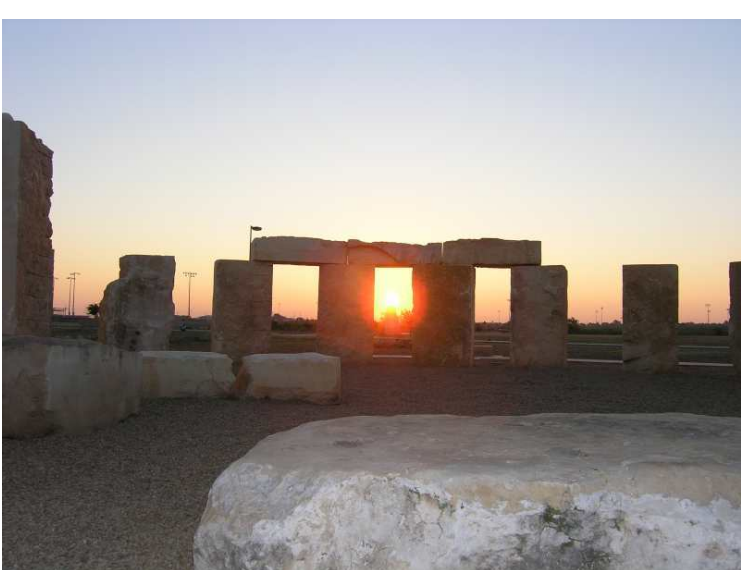
... or watch the sunrise.