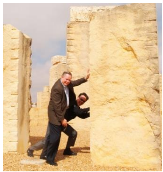
Play with Stonehenge