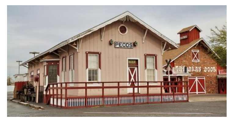
Dine and Be Entertained at the Barn Door and Pecos Depot Steakhouse