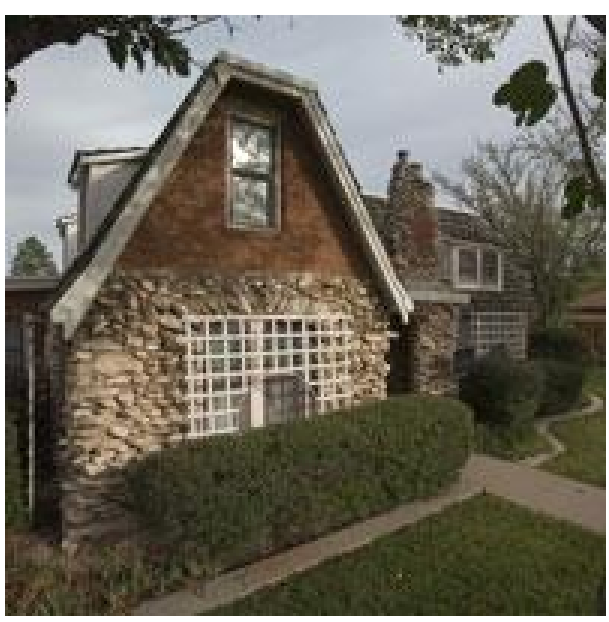
Visit the Parker House Ranch Museum