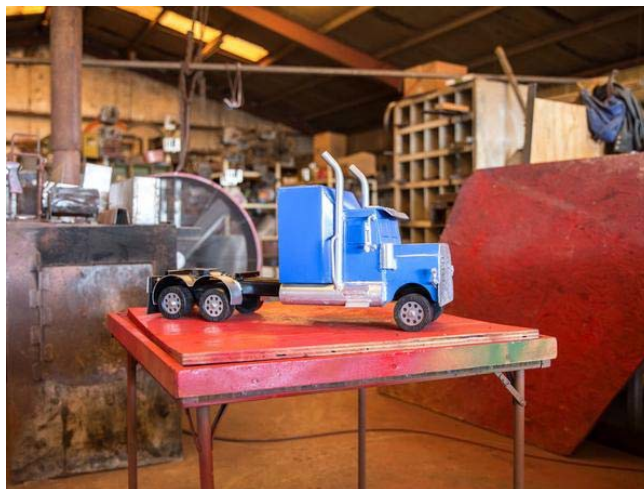
The Happy Toymaker, Happy Texas